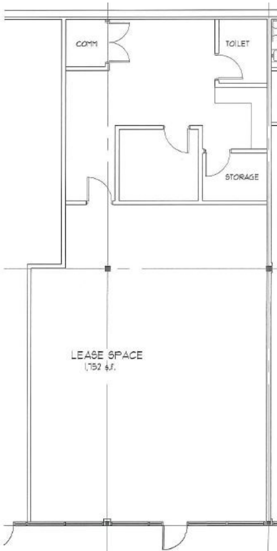
Suite 107: 1,752 SF