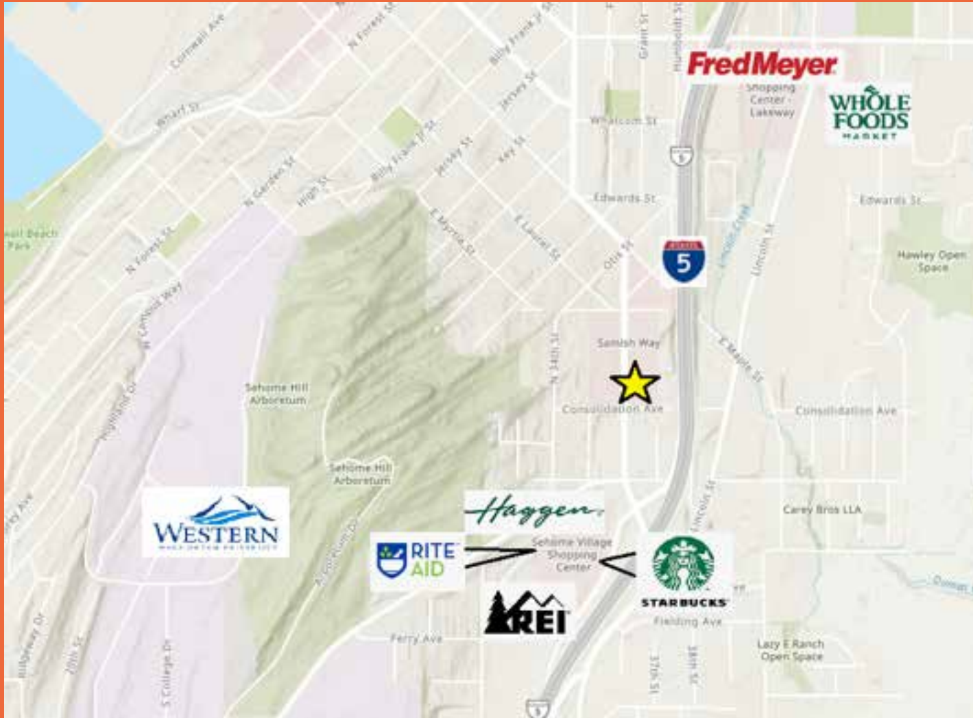
MAP + AMENITIES